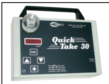
VersaTrap Cassette mounted on QuickTake 30 Sample Pump

The SKC QuickTake® 30 sample pump is especially easy to use with VersaTrap as it is designed for spore trap cassettes to mount directly onto the pump and supplies the features and accessories most needed for bioaerosol screening. The highly versatile QuickTake 30 sample pump can also be used with wall samplers, standard filter cassettes, impactors, and remote media. A programmable timer allows unattended sampling.